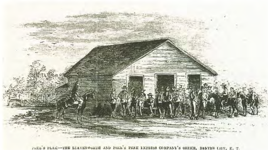
PIKE'S PEAK--THE LEAVENWORTH AND PIKE'S PEAK EXPRESS COMPANY'S OFFICE, DENVER CITY, K. T.