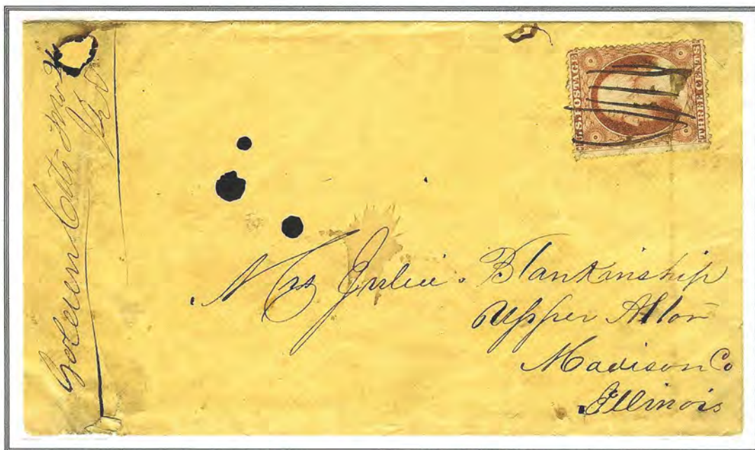
Golden City, Kansas Territory ~ June 26, 1860

Golden City was established as a gold-rush town and quickly became a leading economic and political center of the region for a short time. By the end of 1860 the town had been popularly elected the seat of Jefferson County was considered the location of the provisional government of the Jefferson Territory. The town built right at the foothills was much closer to the mines than Auraria or Denver City. These events lasted a short time as political power shifted to Denver City.