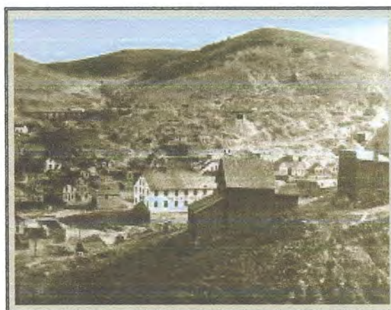
Mountain City Circa 1860's